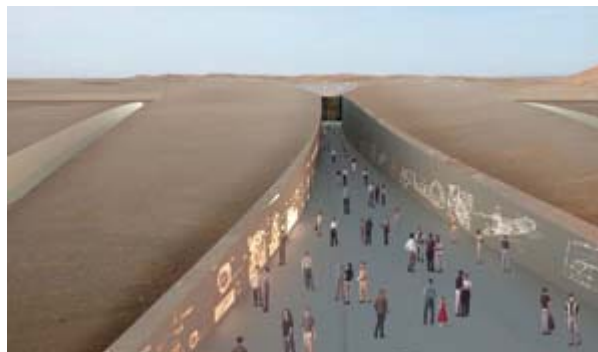
Rendering of the entrance at Spaceport America, the first purpose-built commercial space terminal, which will be built starting next year near Las Cruces, NM

Back in the U.S., technology is being taken to new heights—quite literally—in New Mexico, where the nascent space tourism industry is being created. Ideal flying weather and wide open spaces have contributed to an expanding aerospace industry that