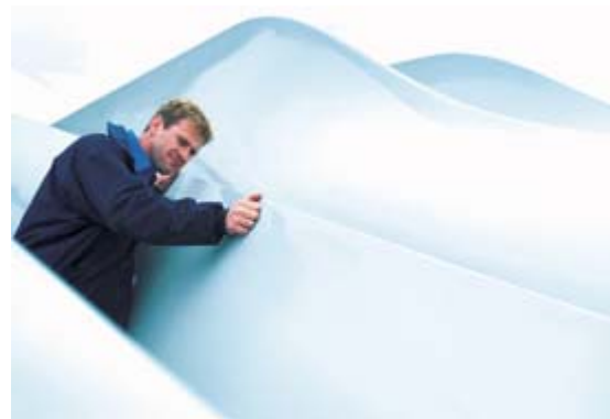
An employee for Gurit, located on the Isle of Wight, checks on the quality of finished wind turbine blades.

The city, which is home to the University of Oulu, became known as a wireless technology hub in the decades since Nokia built an R&D facility there more than 30 years ago. Today, some 800 high-tech businesses, mostly specializing in wireless technology, employ about 18,000 people