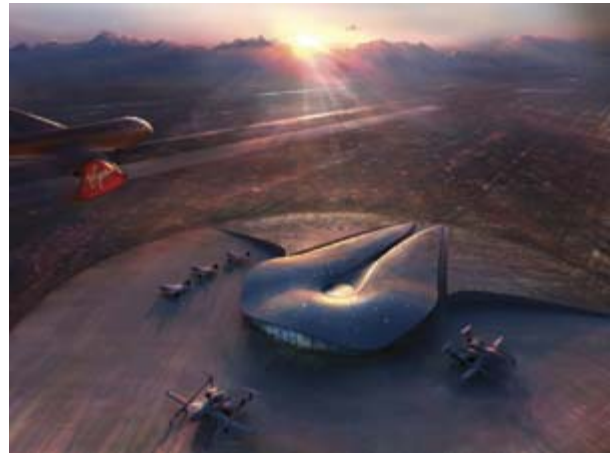
Rendering of a flight at dawn at the Spaceport

In related news, New Mexico officials heralded the recent announcement that Rocket Racing League, an aerospace entertainment organization that is developing a market for low-altitude, rocket-powered aircraft racing, will locate its headquarters and technology development facility in Las Cruces. The 50,000-square-foot building will be located on 10 acres of land donated by the city of Las Cruces. The league will generate revenues through sponsorships, merchandising, ticket sales, video games, broadcast rights, and tours.