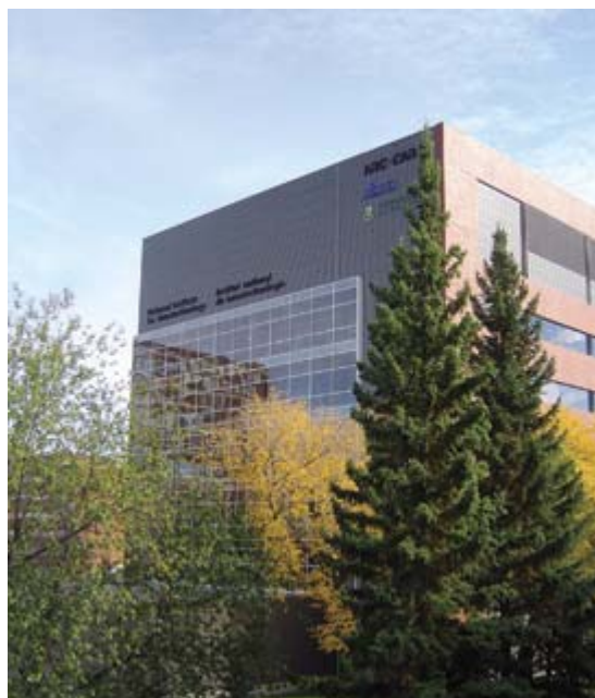
The National Institute of Nanotechnology in Edmonton, Alberta, Canada